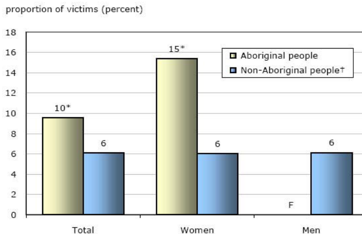
Self-reported spousal victimizations in the preceding 5 years, Canada's ten provinces, 2009